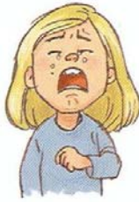
TO CRY LLORAR