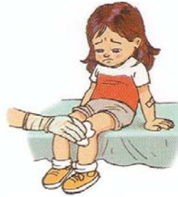
TO CURE CURAR