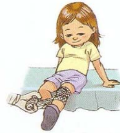
TO BANDAGE VENDAR