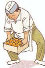
TO UNLOAD DESCARGAR