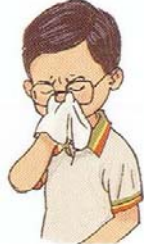
TO BLOW ONE'S NOSE SOPLARSE LA NARIZ