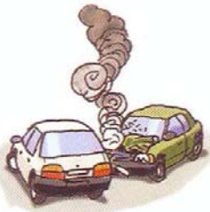
TO CRASH CHOCARSE