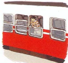
TO TRAVEL VIAJAR