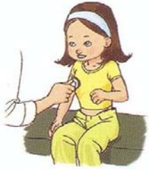
TO BREATHE RESPIRAR