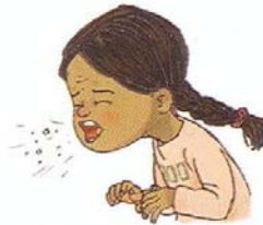
TO SNEEZE ESTORNUDAR