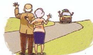
TO SAY GOOD-BYE DESPEDIRSE