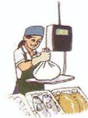
TO WEIGH PESAR