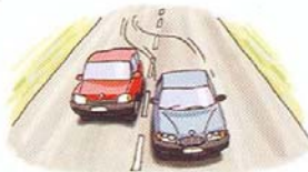
TO PASS ADELANTAR