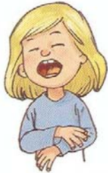
TO LAUGH REÍR