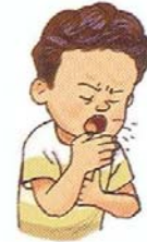
TO COUGH TOSER